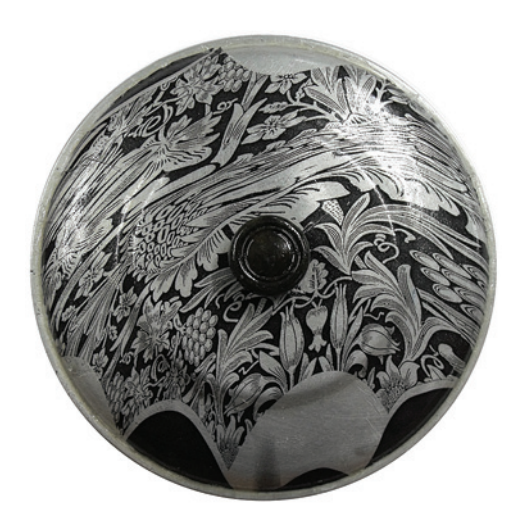
Figure 4: Jacqueline Roach, untitled Warp#3 , 2009. Gel transfer applied to aluminium, single detail from installation.

This involves approaches to printmaking contexts that encompass popular culture and new technologies, and simultaneously acknowledge printmaking's longstanding art-historical practice contexts. This involves raising our gaze from the contingencies of materials and process to again invest in printmaking as a field of research and practice with the ability to dynamically infect and inflect interdisciplinary cultural visual arts activity. The resulting shifts in practice modes will result in a hybridised form of printmaking that can