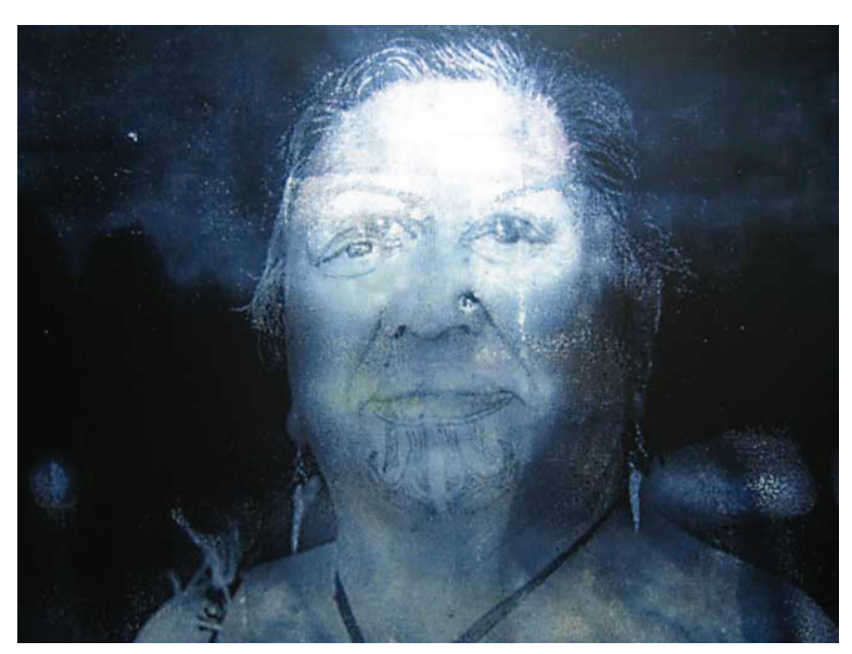
Figure 1: Evelyn Kawhiti, Wahine Kauae Whakapapa, 2009. Screen printed on both sides of a sheet of glass, image printed in four colours.

As an artist and art educator, my material and theoretical investigation in print seeks to make a contribution to the collective task of reinvesting in the medium. My interest is in ensuring that print can continue to make a vital contribution to contemporary interdisciplinary art practices. My fear is that, with printmaking delivery in many art schools under pressure, the potential for printmaking and printmakers to contribute to contemporary art practices is reduced. Printmaking, in all its forms, contributes to a richer and more diverse set of interdisciplinary art practices. Without the "inter" component of interdisciplinary art practice that printmaking can deliver, the resulting default position is more of a single disciplinary art practice. This is a disciplinary practice that speaks to a potentially restrictive orthodoxy in art and art education. This may result in a narrowing of the scope of art discourse toward more neutral and centrist cultural positions that do not easily allow for difference.