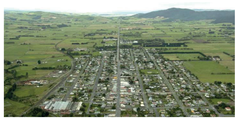
Figure 1: Milton