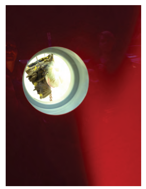
Figure 6. PEEP. Peeking through Te Uru's covered street access window box for a glimpse of the jewellery objects to be given away to members of the public.

This third iteration of the CLINK Project once again provided an intensive learning opportunity through experiencing contemporary craftwork at first hand. The project presented professional networking opportunities, as well as the awareness of belonging to a wider community of craftspeople who inherently embrace a philosophy of generous sharing. Last but not least, CLINKproject.3: Collaborism compelled the participants to not only be artists and curators, but to also collaborate as writers; this project report bears the fruits of a final writing workshop gathering. On reflection, our own experience of interaction with other professional speakers and makers mirrored the engagement we provided for the wider public in Te Uru's gallery setting.