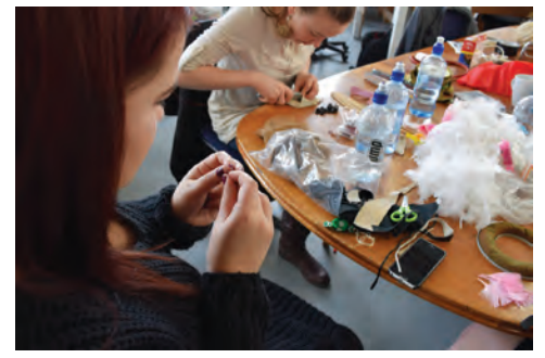
Figure 4. Colab I-5. Collaborative making full of unexpected symbioses at Hungry Creek Art and Craft School. graphics were both a take-away and tangible record of CLINK's endeavours to broaden public engagement with contemporary jewellery practice.

The exhibition finished with the work being given away to members of the public.