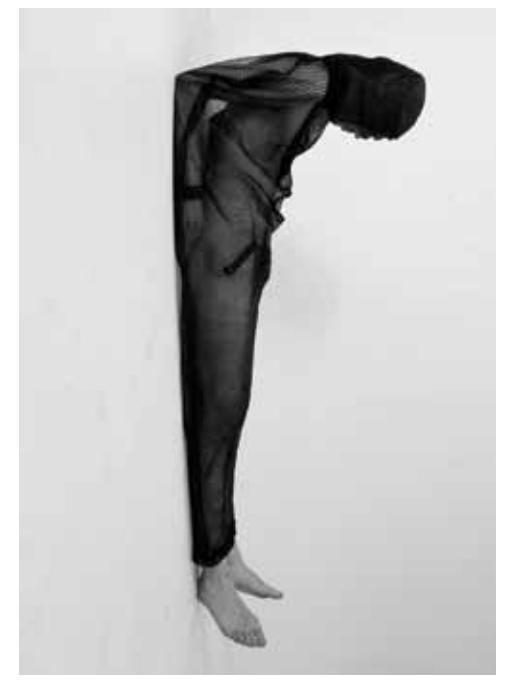
Figure 5. Neil Emmerson, Figure, 2016.