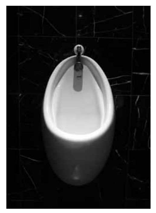
Figure 4. Neil Emmerson, Urinal, 2016.