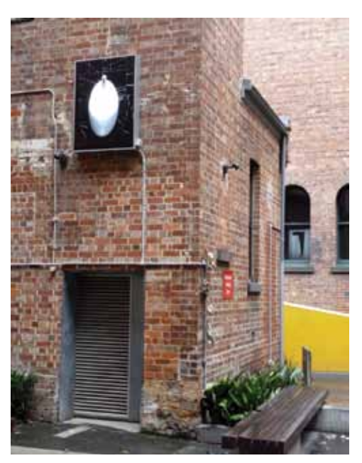
Figure 2 and 3. Neil Emmerson, Untitled (broadcast/urinal) ,2016 and Untitled (broadcast/figure) , 2016, digital print on clear acrylic, metal light box.