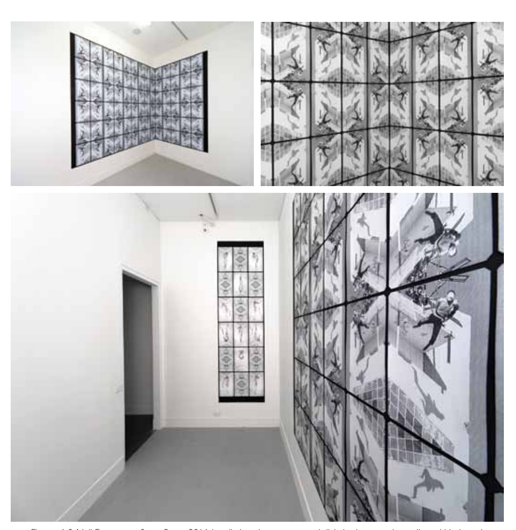
Figures 6-8. Neil Emmerson, Spare Room, 2016, installation views, screen and digital print on arches velin and black card, acrylic paint.