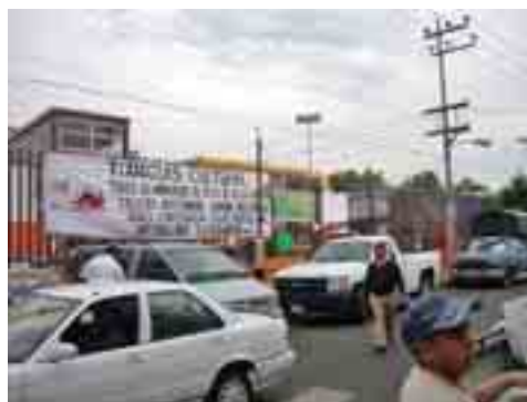
Figure 3. Centro Cultural Multidisciplinario, “El Casetón,” Iztapalapa, District Federal, Mexico City, April 2010.

Along with conceptual, political and geographical boundaries, the boundaries of academic thinking and writing are being pushed here also. This piece of writing is presented as a layered metaphor of exhibition. Commentary, conversation and contextualisation appear alongside, presenting, woven through and framing the works and Peterson’s crafted responses and stories. Curator as artist and writer as curator. Together we offer a variety of discourses both critical and descriptive that relate to some key curatorial ideas such as: postcolonial representation and the notion of ‘represent’ (to make a statement through presence, words and actions); independent curating; collaboration, networking, opportunity and access; community activation; curating the polyphonic or third space 3 and the altermodern 4 – all pertinent to the literal and metaphorical border crossings and relationships discussed. 5 As contemporary curator and interview enthusiast Hans Ulrich Obrist summarised in his forward to Caroline Thea’s On Curating (2009), “the twenty-first century curator is a catalyst – a bridge between the local and the global ... This is a metaphor for how one crosses the border of the self.” 6