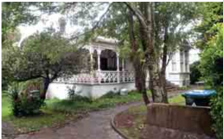
Figure 1. Luke Willis Thompson, inthisholeonthislandwhereiam (2012). Image courtesy the artist and Hopkinson Cundy, Auckland.

We found ourselves in a wide hallway. The two bedrooms to the left and right of the front door were wedged closed with a pair of undies. We assumed this meant that access was denied. The hall cut a path through the centre of the house from front to back or, at least, such a path would have been possible if the hallway hadn't been cluttered with piles of stuff. The stale-smelling, dark passage was clearly the main dumping ground for the family's overflow of furniture, papers, clothes, and toys. Rubbish bags filled to capacity sagged on the floor; stuffed toys lay face down on the carpet, like a child had staged a crime scene, and towards the far end of the hall, two cupboards on either side spilled their contents into the space, blocking the way through.