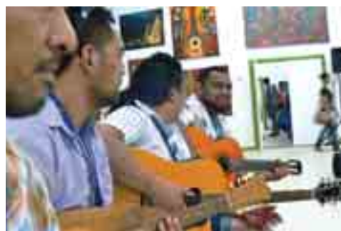
Figure 15. Pacific Underground and 'Koile perform at the Opening of the Art Exhibition.