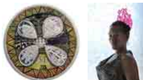
Figure 5. Michel Tuffery, Commemorative coin (detail), 2012.