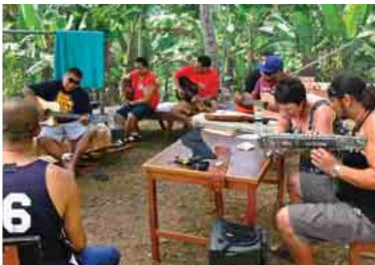
Figure 3. Members of 'Koile and Pacific Underground practice outside their accommodation block.

Block one accommodated our senior artists. Block two was allocated to the Te Matarae Kapahaka group (national kapahaka champions in 2011) and block three, aka 'The naughty block,' was our block. Block three is where everyone gathered almost every night to sing along to the collaboration sounds of Pacific Underground and 'Koile Band. Other artists on the block were the Nga Kaihanga Uku or Clay Artists Collective who worked on their pieces as music played late into the night. They encouraged others to try making their own pieces as well. Naughty Block also had Maori and Pacific Island actors, sculpture artists, weavers and painters. It was the coolest block. Hell, we even had visitors from the Solomons, Fiji and Rapa Nui delegations come to hang out and party with us.