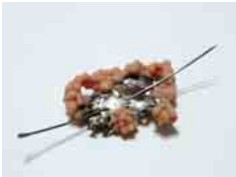
Figure 4. Selina Woulfe, Untitled (flesh) (2012), polymer clay, silk thread.

During my own experience I chose to have supporters with me while I underwent the procedure. The jewellery pieces, called 'silvergrafts,' are a series of protective adornments that actively cause pain when worn, being attached to the body with a surgical steel pin by a piercing artist. These abstract jewellery versions of skin grafts are a fine filigree of raw, undulating silver mesh.