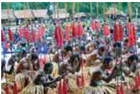
Figure 5. Pasifika Stage – local group.