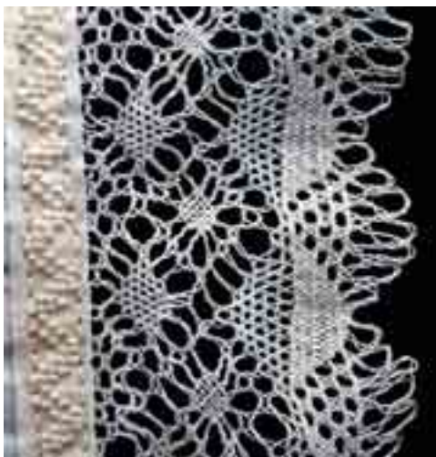
Figure 6. Intricate hand-stitched Lebanese lace work. Detail from sleeve of laying out garment.

The daughter of a migrant from Lebanon recounts an incident in her father's life. 11 In Lebanon, during the First World War, her father who was then just eight years old was escaping from institutionalised life after being orphaned. Sick and exhausted, he took shelter in a cow barn which belonged to a Muslim family. The family nursed the boy to health and cared for him as a son for eight years, all the while encouraging him to continue practising his Christian tradition, appreciating its importance to his identity. Stories of such kindness are too numerous to recount here. However, what is crucial from cross-border conversations, is that a basic tenet of their faith is behaving ethically and accepting responsibility to contribute to the well-being of others. Faith, whether or not we subscribe to a particular religion, is what prompts us to nourish the well-being of others, even though it may require effort and sacrifice for ourselves.