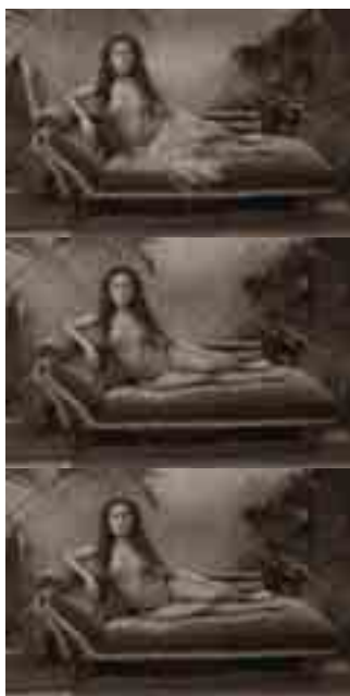
Figure 1. 'Fa'afafine; in a manner of a woman' (2005) Triptych 1/3, Shigeyuki Kihara. Image courtesy of artist and Sean Coyle.

Kihara's photograph is clearly staged in a studio but uses background props to create an illusion of being set in the natural world... In his influential writings on photography the theorist Roland Barthes coined the term 'punctum' to describe an, at first inconsequential detail that pricks at you as it does not seem right. 2