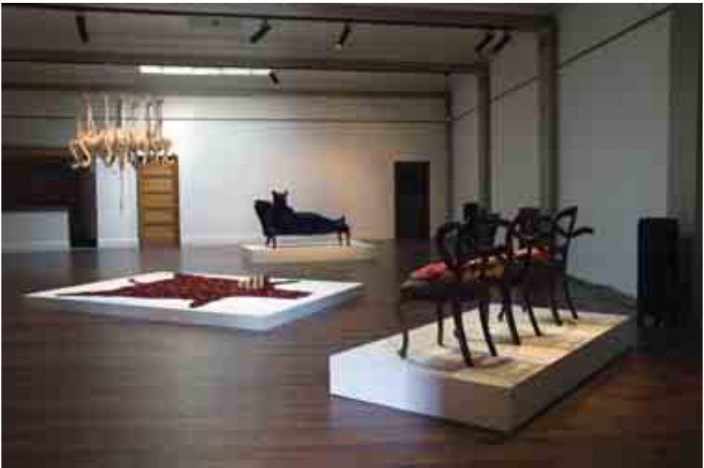
Figure 1. Resisting Africa (2011), exhibition view.

The exhibition “Resisting Africa” was presented at the Temple Gallery, Dunedin, from 12 August to 2 September 2011 and was the conclusion of my Master of Fine Arts degree undertaken at the Dunedin School of Art at Otago Polytechnic – Te Kura Matatini ki Otago, New Zealand. Founded on a critical reflection of my youthful travels as a tourist in Morocco and Kenya, the show explored my inherent consumption of Western tropes of Africa as an ‘exotic’ or ‘savage’ locale. Through research into the critical frameworks and histories bound within the discourse of postcolonialism, I was able to ‘unpack’ my discrete tourist experiences and reflect on my travel with new insight. The following essay introduces aspects of this research in relation to the final artworks produced for this show.