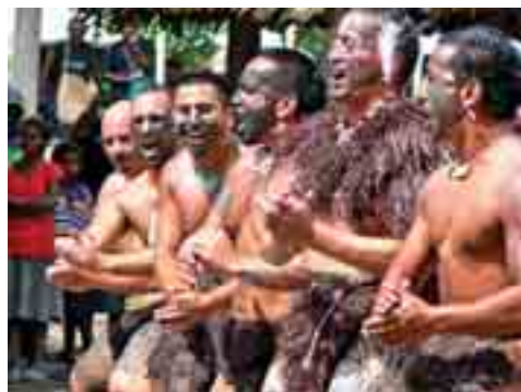
Figure 2. Te Matarae i o Rehu.