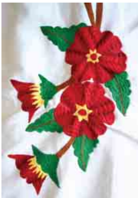
Figure 4. Tupenu moe tangai pilo matala'i'akau, Embroidered sheet and pillowcase set, 1993/94. Made in Auckland, New Zealand, by Tu'utanga Hunuhunu Māhina.

restricted to, tufunga tāvalivali (painting), tufunga lalava (kafa sennit-lashing), tufunga langafale (house-building) and tufunga tātatau (tattooing). Faiva includes, but is not restricted to, faiva ta'anga (poetry), faiva hiva (music) and faiva haka (dance). Nimamea'a includes, but is not restricted to, nimamea'a lālānga (mat-weaving), nimamea'a koka'anga (barkcloth-making) and nimamea'a tuikakala (flower designing). The three categories of art are connected to the 'gender' divisions of functions between men and women in Tonga where tufunga and faiva are predominantly male-dominated activities and nimamea'a are predominantly the domain of women. However, there are areas where these gender divisions can overlap, 7 such as women artists who are involved in faiva performance arts as well as in nimamea'a or fine arts.