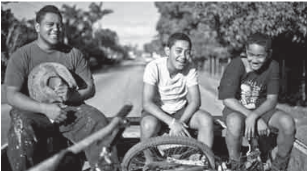
Figure 1 and 2. Project team and partners at work and rest in Tonga.