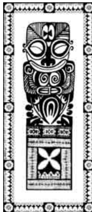
Figure 9. Donald Harman, Scale design for Tapa Window , 2009. Digital Print, 1680 x 725 mm. Collection of the Artist.