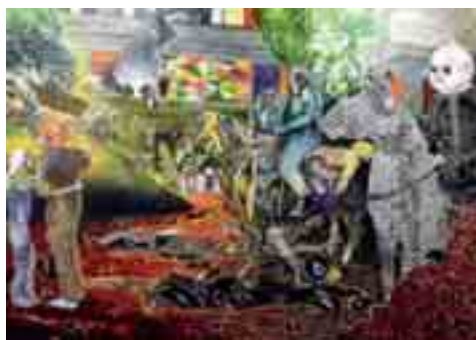
Figure 2. Kenneth Merrick, Us and Them (2011), mixed media on vinyl; 2400 x 3200 mm.

Actively assessing how individual works relate to each other helps me to build on potential compositional applications. More often than not, these are only starting points, which never offer up formal solutions but rather prompt further questioning. Adopting this