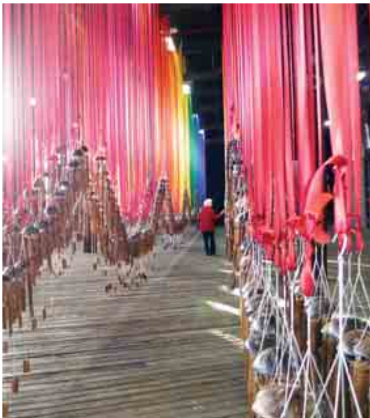
Location 2. Tiffany Singh, Knock on the Sky Listen to the Sound (2011), bamboo wind chimes and mixed media, dimensions variable. Installation view of the 18th Biennale of Sydney (2012) at Pier 2/3.

listener inhabit the space of the story. Telling stories connects us and allows us to care, to be; it is an activity that fosters collaboration; it aggregates knowledge and generates new ideas; it ignites change; and, ultimately, it builds community. 9