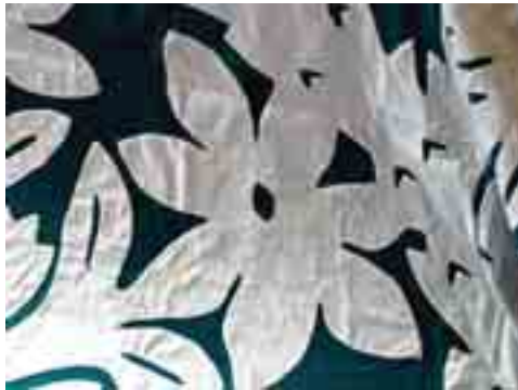
Figure 1. Detail from traditional stitched tivaevae manu.

occasions, including marriage. Like food, this art form continues a tradition of giving. One Cook Island woman recounts how she didn't really enjoy learning the skills of tivaevae manu at 14, when her Nana started teaching her. Now, though, she says, "no money can pay for what you make from your own hands," and she is proud that she can perpetuate the knowledge and skills of her forebears by teaching her own children. 7 In everyday Dunedin life, finding the time for six or more women to get together to work on a tivaevae is almost impossible. One way this woman adapted is by designing a method of tie-dyeing the tivaevae in the manu style. This process means that she can make a finished product in one day. Adaptation is also reflected in her changing designs which weave together traditional Cook Island motifs with local imagery, such as incorporating a koru into the design of a tivaevae manu made for her daughter-in-law, who is tangata whenua.