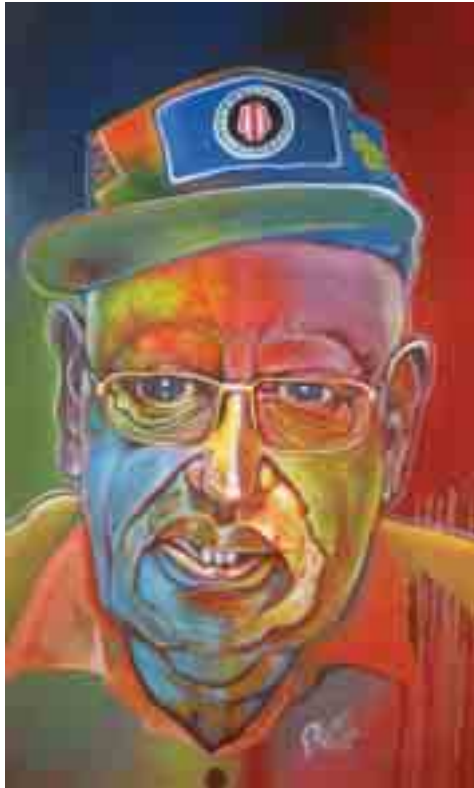
Figure 10. Leonard Tebegetu, The Botanist , 2011, acrylic on canvas.