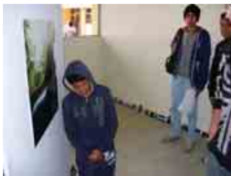
Figures 8 and 9. Students from the Instituto Latino de Mexico, Coyoacán, District Federal, Mexico City, pose in front of their favourite pieces (April 2010).