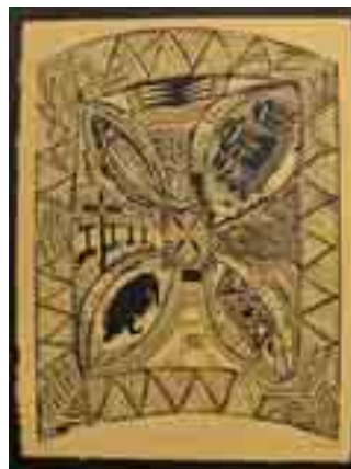
Figure 4. Michel Tuffery, Matai 'Fa Samoa' , 1987. Woodblock on handmade paper 836 x 615 mm. Collection of the Dunedin School of Art.