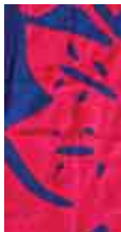
Figure 5. Detail from Cook Island tivaevae manu.