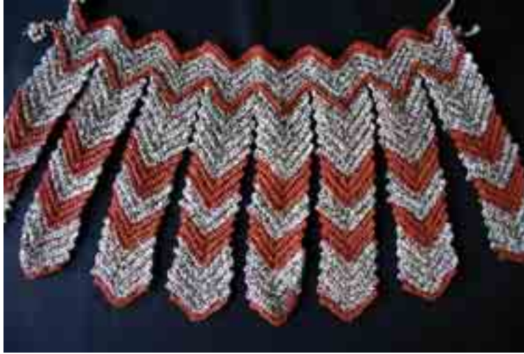
Figure 7. Kiekie (Waist ornament), 2010 by Falesiu Siu. Made from wool carpet yarn.

Embroidered and crochet bed sheets and pillowcases are not only fine works of art in themselves, but are also part of Tongan women's material wealth. As items of wealth they play an important cultural and artistic role in ceremonies involving gift-giving and receiving, such as birthdays and weddings. Other than featuring in such contexts, they are normally reserved for special uses such as decorating the interior of a church for a commemorative Sunday, decorating one's home or a specific venue for the funeral of a loved one, or for use within one's own home on very special occasions.