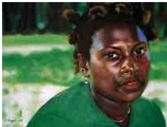
Figure 2. Jeffry Feeger; Jewel in the Rough , 2007, acrylic on canvas.