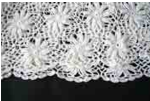
Figure 5. Kofuloto leisi, Crochet top, 1990's. Made in Mt Roskill, Auckland, New Zealand by Lingsiva 'Aloua.