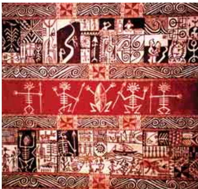
Figure 1. Josua Toganivalu, Speardance (1998), oil on canvas, 1000 x 1000 mm.

Upon founding the Oceania Centre, Hau'ofa established a precedent for creative individuals to join as artists in residence with no predetermined duration, and the use of a shared studio or workshop environment with the expectation that participatory exchange would facilitate skills training. Hau'ofa did not set out to attract established visual artists already set in their ways; instead beginners, specifically young people aged 18 to 24 who were not full-time students or otherwise employed, were targeted to become artists in residence. 31 This attracted mostly young men; relatively few women have become long-term artists in residence. 32 Hau'ofa invited artists such as New Zealand-based Niuean John Pule to conduct workshops for the artists in residence. Pule has returned four times since 1998 to conduct subsequent workshops. During the first workshop, Pule used masi (Fijian painted barkcloth) as a familiar source for inspiration. One of the Oceania Centre's first artists in residence and workshop participant, Josua Toganivalu, identified with Pule and was inspired by him. Toganivalu's painting Speardance (1998) (Fig. 1) imitated Pule's style of utilising the architecture of hiapo (Niuean for tapa) (Fig. 2) to express visual narratives referring to both customary and contemporary life.