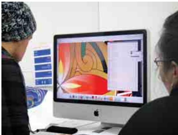
Figure 3. Collaboration process. Artists and designers worked together to refine elements of the vector drawing.

in modern graphic technologies and the tight deadline of the project saw the young designers' capabilities extend. Their hands and eyes contributed significantly to the development of the artworks as they were transformed from simple pencil sketches into large-scale and complex banner graphics. The final designs are the result of an iterative process developed within a team of creative professionals.