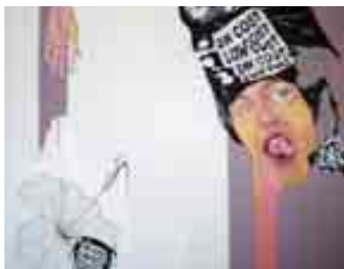
Figure 6. Teina Ellia, Death to Disco , 2012. Oil paint, acrylic paint, graphite pencil on canvas, 755 x 760 mm. Collection of the Artist.