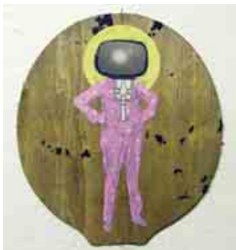
Figure 3. Kenneth Merrick, Hail the New Hail (2012), paper on board; 120 x 160 mm.