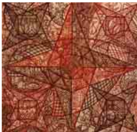
Figure 3. Josaia McNamara, The Eyes of the Star Compass (2001), oil on canvas, approximately 1000 x 1000 mm.

While several art schools exist today, in the 1970s and 1980s there were few, and many of the Pacific Islands still do not have art schools. Therefore, for artists like the majority of those that participated in the workshops described above, the workshops were an opportunity to receive critical instruction and training to develop their art. The case studies illustrate how