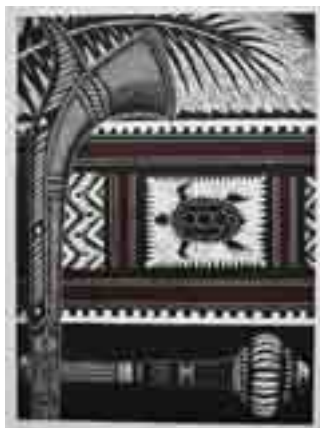
Figure 3. David Teata, Viti , 2005. Woodblock, 705 x 500 mm. On Loan to the Dunedin School of Art.