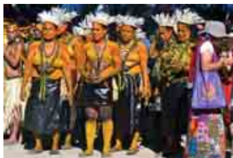
Figure 8. Solomon Islands Provinces group.