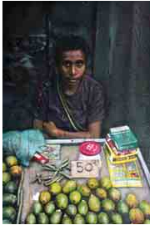
Figure 6. Jeffrey Feeger, Pikinini Kikori ( The Port Moresby Market Collection ), 2011, acrylic on canvas.

The concepts of magic realism add to the power of his paintings because he localizes aesthetic elements of realism to become more meaningful and specific to traditions belonging to Papua New Guinea.