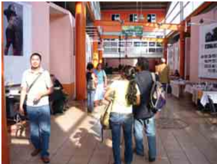
Figure 12. Mexico City audiences viewing the exhibitions at El Centro Multidisciplinario, "El Casetón," Iztapalapa, Mexico City, April 2010.