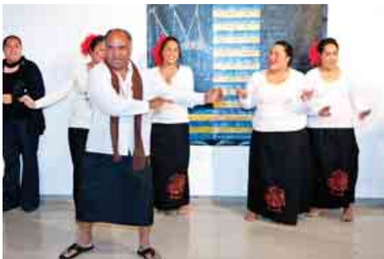
Figure 3. OLA, exhibition preview event