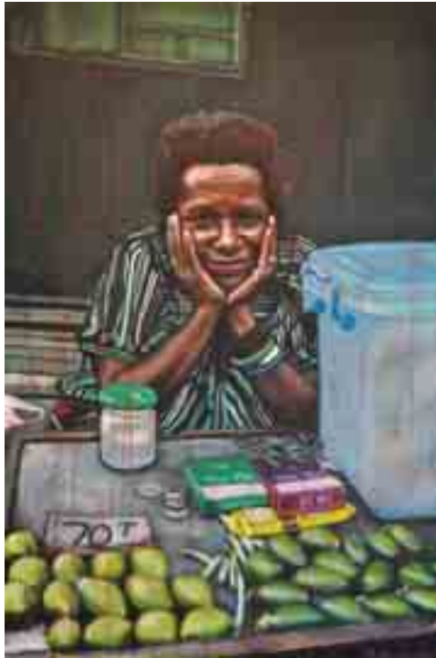
Figure 5. Jeffrey Feeger, Meri Simbu ( The Port Moresby Market Collection ), 2011, acrylic on canvas.