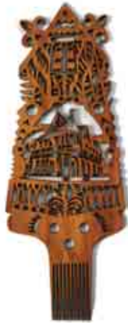
Figure 2. Michel Tuffery, Maota the Courthaus Apia Samoa, 2012.