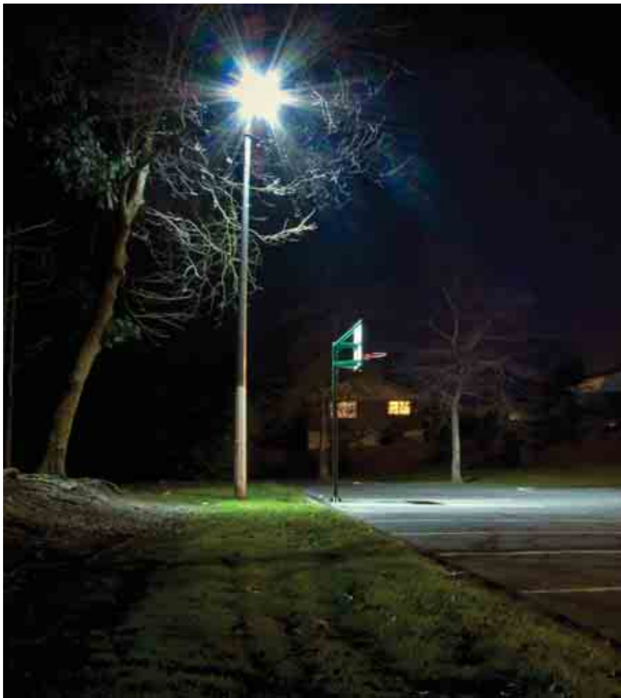
Figure 7. Terry Koloamatangi Klavenes, Untitled 2, South Auckland (2009), digital photograph on archival paper.