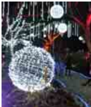
Figure 9. FOPA Light Sculpture.

The festival officially opened on the afternoon of Monday 3 July when all 27 delegations gathered behind the Honiara Council Building to begin the big march to the Lawson Tama Stadium where the Prime Minister, Gordon Darcy Lilo, and the nine provinces of the Solomon Islands – not forgetting the beautiful local children –welcomed us to their island nation. I must say, with a little giggle, that the New Zealand delegation looked very much like tourists marching and waving, without uniforms, holding umbrellas over their heads in the scorching heat.