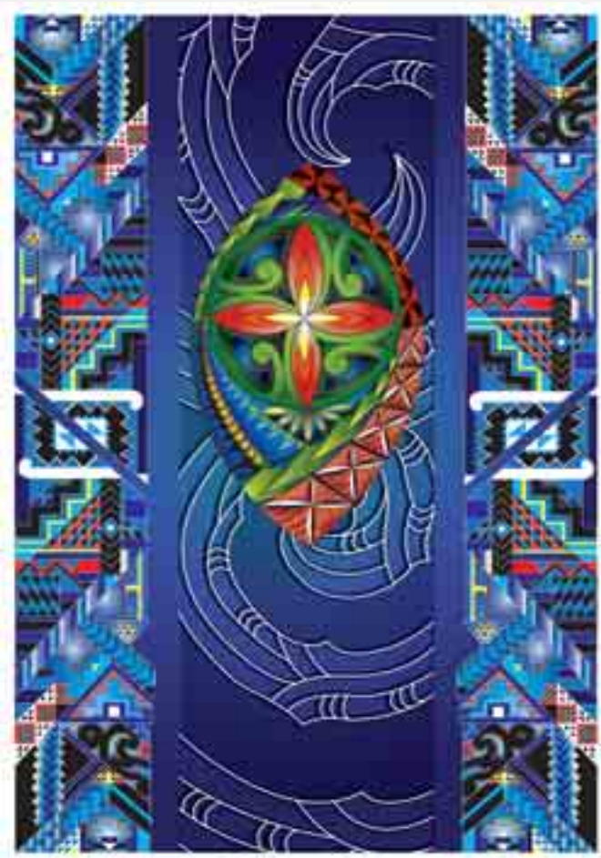
Te Moananui Ā Kiwa

Symbolising strength and the journeys of the ancestors, the ngaru or iro gives the footprint image of the waves and hints towards flow and tides but also challenges. Waves are also an interpretation of consistency and repetition but also waves of change, evolution and creativity. The tides are those that cleanse, heal and create - the blending of wairua within the vibrations of Te Moana Nui Ā Kiwa . The tiare Māori or Frangipani, displays an essence of the grace and beauty contained in the art forms, the dance and the complete shared cultures. The coconut leaves, spread out as do the arm and legs and facets of dance, but also the whakapapa of generations and extending and growing capacity within a family tree.