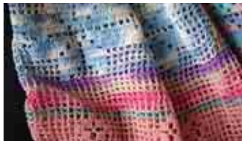
Figure 2. Kofuloto leisi, Crocheted slip, 2009. Made in Mt Roskill, Auckland, New Zealand by Manuēsina Tonata.