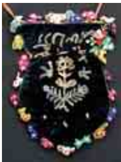
Figure 4. Lebanese embroidered man's velvet pouch, c. 1850.