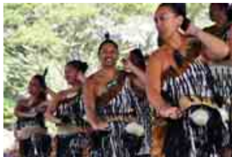
Figure 1. Te Matarae i o Rehu.

We had to pack toiletries such as soap, shampoo, toothpaste, tooth brush, sunscreen, and fly and insect repellent. We could either hand-wash our clothes or