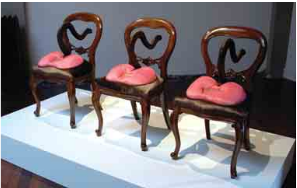
Figure 4. I Dreamed of Africa (2011), mixed media, 90cm x 52cm x 66cm (each).