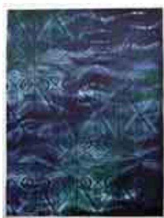
Figure 2. Bridget Inder, Running in the Rain , 2004. Woodblock over Monoprint, 760 x 565 mm. Collection of the Dunedin School of Art.