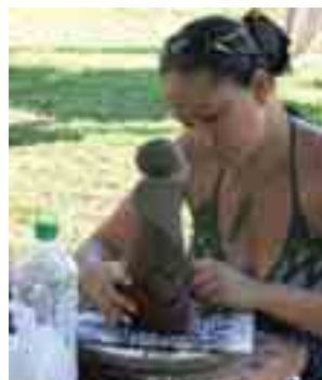
Figure 11. Aotearoa delegation Artist - Carla Ruka