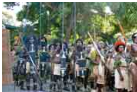
Figure 6. Solomon Islands Provinces group.