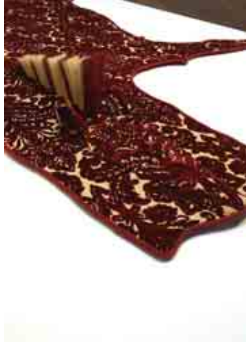
Figure 3. Heart of Darkness (2011) (detail), mixed media, 20cm x 140cm x 180cm.