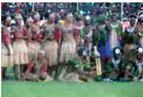
Figure 7. Solomon Islands Provinces group.