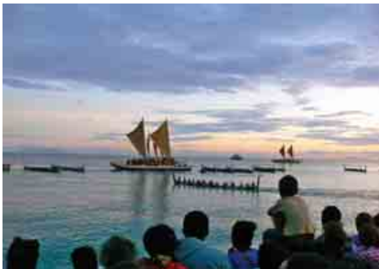
Figure 4. Arrival of the Waka Ceremony – greeted by local canoes.