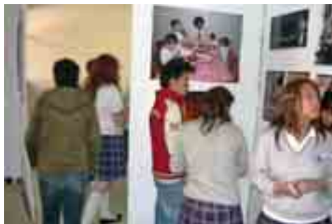
Figure 5. Students from the Instituto Latino de Mexico, Coyoacán, District Federal, Mexico City, April 2010.

All the kids in Mexico at the high school got it straight away. It was a multi-layered exhibition talking about multiple perspectives and experiences – the survival and resurgence of Urban Pacific experience in art, music, body art, language, film, photography ... and politics. People are politics. This exhibition of photography was political. Just taking the exhibition to Mexico was political.