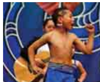
Behind the scenes: preparations, backstage and primary school performances at Otago Polyfest 2012.