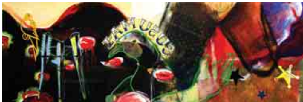
Figure 2. Lily Laita, Welcome to the Westside , 2009.