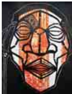
Figure 8. Tere Moeroa, Faces , 2009. Mixed Media Print, 675 x 510 mm. Private collection.