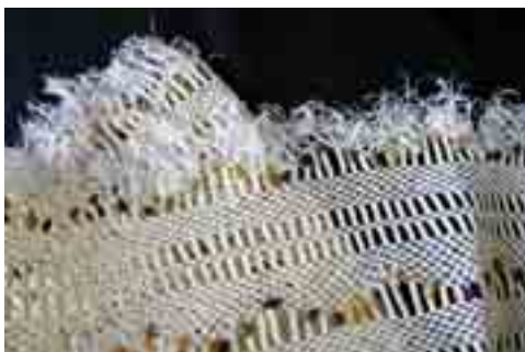
Figure 6. Ta'ovala, Waist mat, 2001. Made in Auckland, New Zealand by Lupe Mahe. (Ta'ovala made from raffia ribbon using hand knotted technique of no'ono'o or sia, from the island of Nuia).

forms, which can lead in turn to misunderstanding and misinterpretation. Such misconstructions sever the natural cyclical flow inherent in the Tongan concept and practice of art, which is plural, holistic, circular and inclusive in approach, as opposed to the individualistic and exclusive Western concept of art.