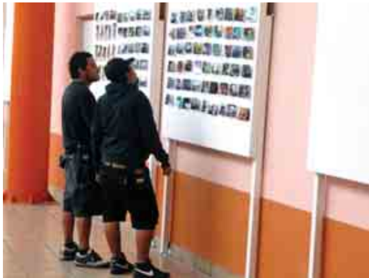
Figure 11. Mexican audiences viewing the Tiaho exhibition, El Centro Multidisciplinario, "El Casetón," Iztapalapa, Mexico City, April 2010.