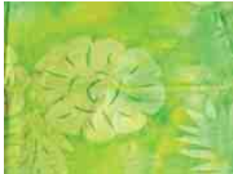
Figure 2. Detail from tie-dyed tivaevae manu.