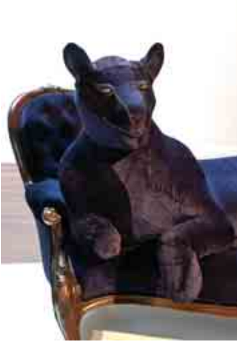
Figure 2. Out of Africa (2011) (detail), mixed media, 105cm x 180cm x 110cm.