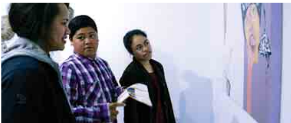
Figure 13. Opening night guests look at a work by Teina Ellia.