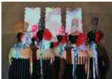
Figure 4. Dancers Installation of exhibition at Pataka Art and Museum, 2012.

Michel Tuffery MNZM was born in 1966 in Wellington of Samoan, Cook Island and Tahitian descent. His creative output is extensive as he is adept at all arts media, printing, painting and sculpting, and he works collaboratively with technicians and other art practitioners to realise his performance and installation projects, which require moving image, light and sound. His concerns are measured and politicised around the conservation of the environment and shaped by his Pacific Island ancestry. His visibility as an artist has been achieved through awards, commissions, international residencies and exhibitions, and his art is held in numerous public and private collections.