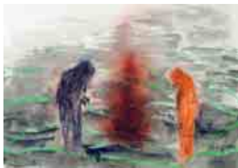
Figure 1. Kenneth Merrick, Conjure (2012), mixed media on paper; 150 x 210 mm.

In many ways, my approaches to image-making and research are akin to the archaeological dig. By clawing, gnawing and drawing in the ever-expanding media junkyards, I am able to make sense and nonsense of the world around me, and my place within it.