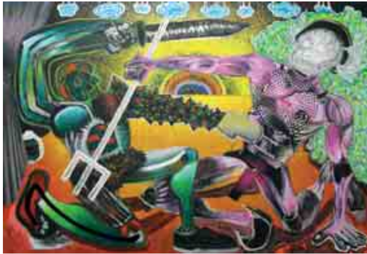
Figure 4. Kenneth Merrick, Homo Heroica (2012), mixed media on board, 1100 x 1600 mm.

type of approach enables me to forge connections with internal and external impulses, broadening my understanding of how each is manifest in the connective narrative threads and relationships between each image.