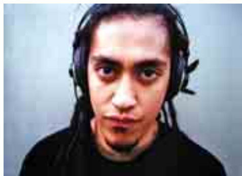
Figure 1. Marlon Rivers, Othersreq Bitch! (2010), digital print.

GP: For the last 20 years I have worked as a lecturer and curator. Nearly all my curatorial work has been aimed at young people, and my projects are known