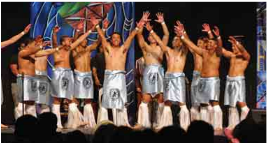
High school performances from evening sessions, Otago Polyfest 2012.