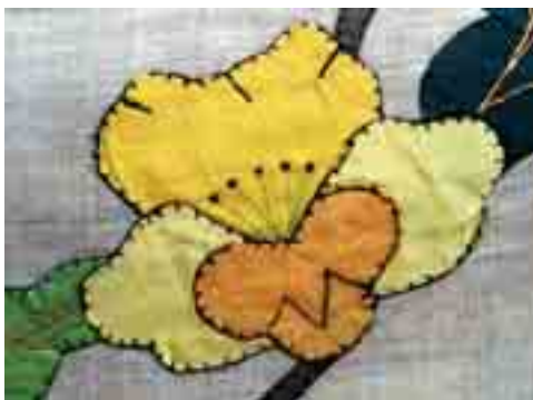
Figure 3. Detail from Lebanese hand-stitched linen cloth, late 19th century. Note similarities of form with Cook Island tivaevae manu.