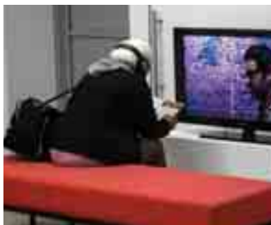
Figure 7. Paranesia (installation view of opening night).