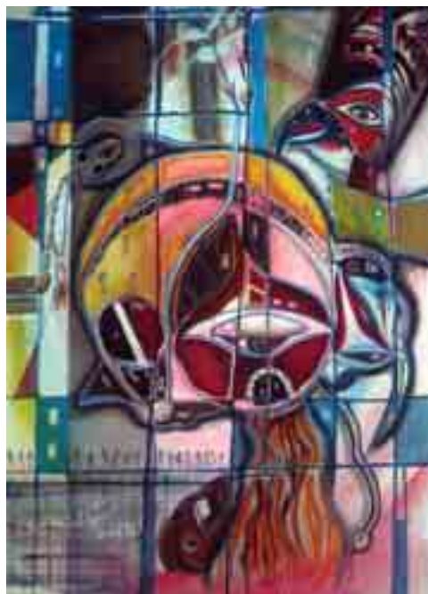
Figure 8. Leonard Tebegetu, Tatanua I , 2007, acrylic on canvas.