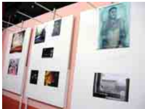
Figure 2. “Tīaho: Photography and Moving Image from Oceania,” El Centro Cultural Multidisciplinario, “El Casetón,” Iztapalapa, Ciudad de Mexico, April 2010.