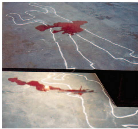
Figure 2: Robert Ballagh, Bloody Sunday Floor Drawings (1972).

Robert Ballagh's 1972 Bloody Sunday Floor Drawings was an early art-as-performance interface that used the artist's forensic outline to body-map a mass shooting in order to register a resounding act of military transgression: Bloody Sunday, Derry, 30 January 1972. Ballagh's work was literal, illustrative and only partially successful. The work's location at the Project Arts Centre in Dublin disconnected it not only from its source and location, but also from the aspirations of direct social and political engagement implicit in the artistic actions of performance art activity. It is, however, in early artistic engagements such as Ballagh's that we see a willingness to emphasise the body relative to a current public event and its subsequent trauma.