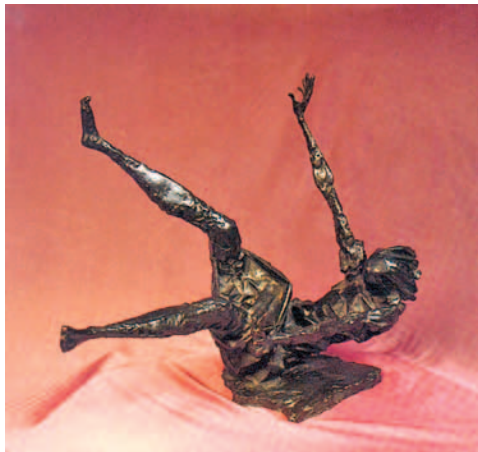
Figure 1: F E McWilliams, Women of Belfast (1972-75), sculpture, bronze.

In the early 1970s, artistic responses to the viscosity of the developing civil conflict in Northern Ireland had tried to find a suitable language for political and social engagement. A number of early responses, such as the series by F E McWilliams, Women of Belfast , tended towards illustrative comment made through conventional media such as sculpture or painting. However, a generation of emerging artists felt an inability to adequately confront daily violence through these traditional means of portrayal and exposition.