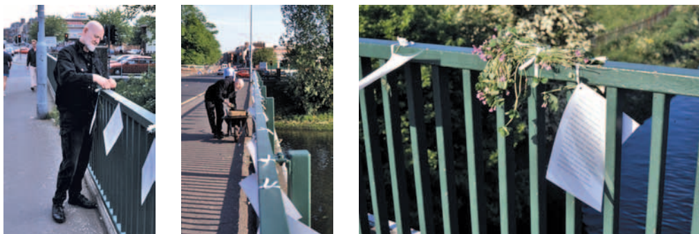
Figure 6: Alastair MacLennan, Naming the Dead , performance piece, Belfast, 1998.