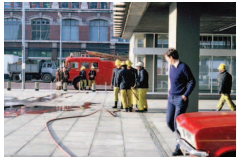
Figure 7: André Stitt, Art is not a Mirror it is a Fucking Hammer , performance piece, Belfast, 1976-78.