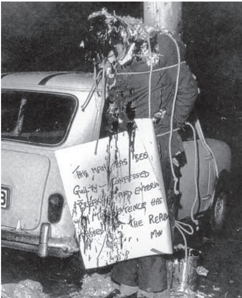
Figure 10: Tared and feathered victim, Northern Ireland.

culture – acts of penance – and to Protestant culture – ‘tarring and feathering’ as an act of public punishment and humiliation.