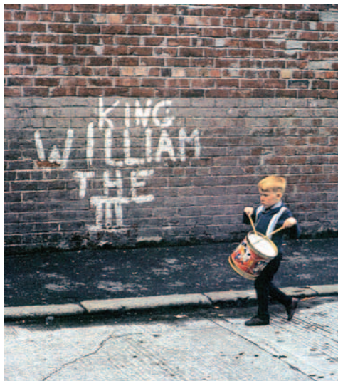
Figure 8: Street kid with drum and 'King Billy' wall graffiti, Belfast.

In Conviction , I confronted the legacy of the Troubles and my relationship to Belfast as an environment that incorporated a psycho-geographical personal history, and made a symbolic ritual journey that had a correlation to the lives lived and lost in the areas I travelled through. I negotiated divided territory on hands and knees in an act of penance and humility. The work became a cathartic act of transformation, redemption and healing. The performance activity incorporated elements of ritual relative to Catholic