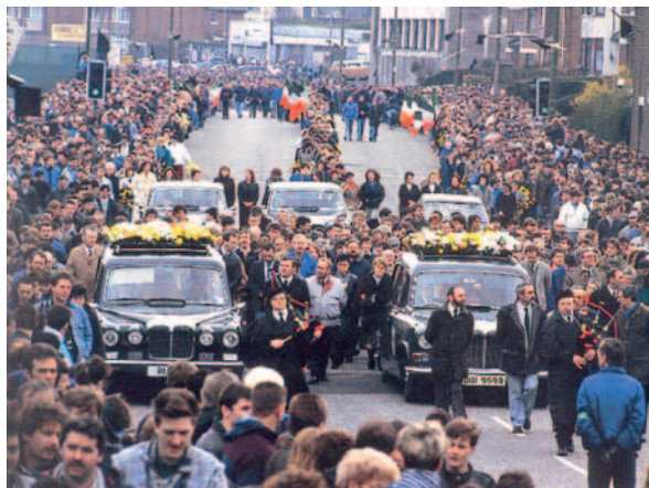
Figure 3: The annual Twelfth of July Protestant Orange Order marching in Northern Ireland.