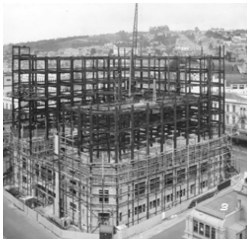
Figure 2: The Chief Post Office under construction in 1934 (image in the public domain).