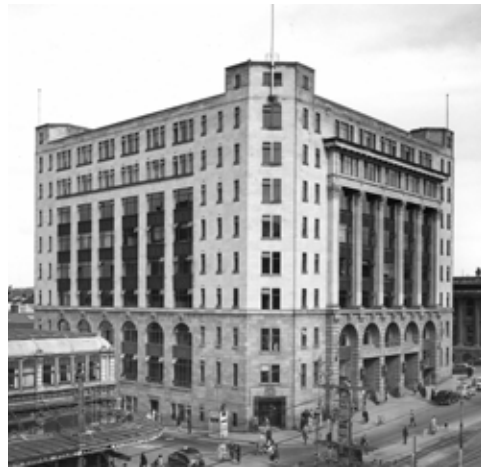
Figure 1: The Chief Post Office in 1937 (image in the public domain).

The Chief Post Office building was built across Water Street from the Exchange Building. At the time of the opening of the post office this was the social and economic centre of the city. The Post Office became an integral part of the functioning of the urban community in Dunedin. Archived film footage of parades from the 1930s and 40s illustrates the central position, both geographically, and socially, which the Post Office held. The architecturally unique, particularly Manhattanist feature of the veranda acted as a natural stage for viewing community events and parades, and in turn for being viewed. The veranda opened through the bronze entrance way into the large atrium labeled as public space on the plans. This in its time would have been a spectacular space, covered in marble and native timbers and lit from above by the light well. The public foyer was the central public space for the entire Post Office. The arrangement of this space in comparison to contemporary post shops demonstrates clearly the changes that would occur over the next 50 years.