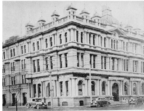
Figure 6: The original façade of the NMA Building, which was built for the Union Steam Ship Co. in 1929.