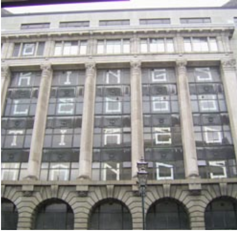
Figure 3: Graffiti on the Post Office: "Blind kings led by tired hands", 2007.