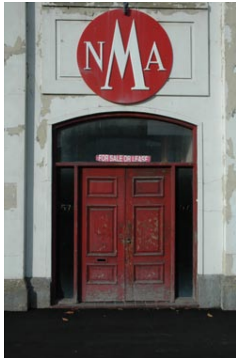
Figure 11: The rear entrance to the NMA Building, 2008.