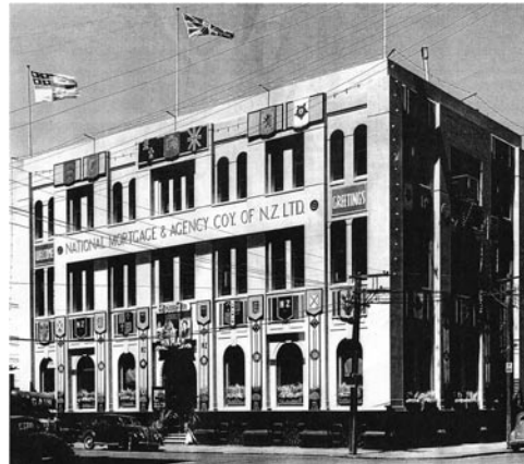
Figure 7: The NMA Building decorated for the Queen's visit in 1954.