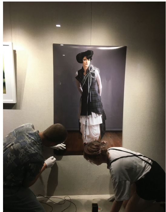
Figure 5. Anything Could Happen. A large photograph of Mild Red fashion being installed.