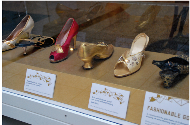
Figure 8. Fashionable Gold. The variety of ways “gold” appears on women’s shoes.

formal fudangi , komon and yukata ; men's formal haori and hakama and informal kimono ; children's kimono worn for the Shichigosan festive day for three- and seven-year-old girls and five-year-old boys in November; and other festivals; various inner kimono and many gorgeous obi and other belts and accessories, thanks to the generosity of Otago citizens. We used T-shaped stands for many kimono and obi , although some complete ensembles were shown in the round. The extensive display allowed us to explain some of the detailed and subtle meanings of patterns and colour in Japanese dress.