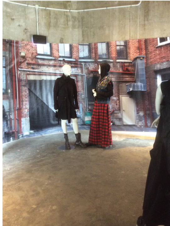
Figure 2. A Darker Eden, NOM*d garments and Dunedin buildings backdrop.

“Re:Emerging” consisted of four cases with iD emerging designer finalists’ garments and related museum artifacts shown on a large touch screen. We could not display museum dress artifacts in the small space of the airport exhibition, which also did not meet conservation requirements such as specified light and humidity levels. Instead, we had examples and text on a touch screen. Digital presentation of fashion – a wonderful adjunct, if not a completely satisfactory alternative to real objects – allows close-ups of garment details that cannot be seen so easily in a gallery display, inclusion of other images showing related work in context, and provides space for expanded textual information. We used touch screens again in “Fashion Forward.”