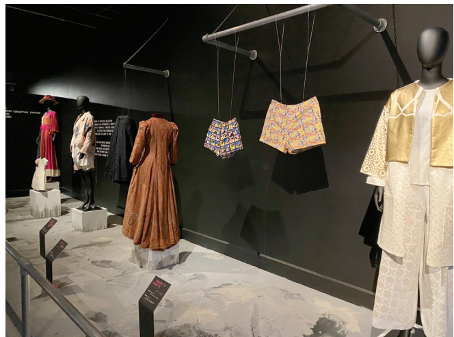
Figure 1. Fashion FWD: Disruption through Design. Wellbeing section, showing the back of the tea-gown.

Different kinds of display forms were used to differentiate museum objects from emerging designer outfits. Designers’ garments were mounted on black shop mannequins with heads, while museum garments hung on headless dress forms or Fosshape structures. Other themes and ideas emerged too, such as the value of creativity, the talent and skill of makers, and the range of textiles and materials available and the inventive ways these have been treated and used. Implicit in such an exhibition are also stories: about the emerging designers themselves and their subsequent careers; about the owners, wearers, and makers of the historical pieces; about consumption patterns, changes in fashion and aesthetics, and sustainability concerns. Viewers voice their own nostalgia and stories when they see particular artifacts.