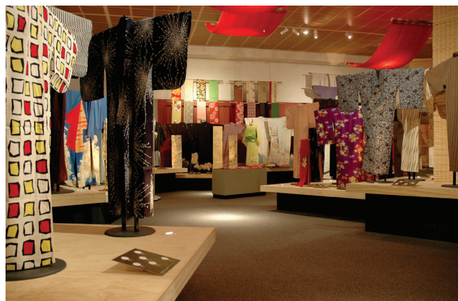
Figure 7. Kimono: A Japanese Story. View of less formal kimono, and obi.

“Kimono: A Japanese Story” was a large, crowded installation of the extensive gift that the people of Otaru had sent to Dunedin. It comprised just over 200 men’s, women’s and children’s kimono , yukata , haori and hakama , obi and other accessories that became part of this show. Members of Dunedin’s Japanese community helped enormously with identifications, translations and tasks such as pairing kimono and obi appropriately. “Kimono: A Japanese Story” included formal women’s mon-tsuki , tomesode , furisode , uchikake , homongi and mourning kimono, as well as less