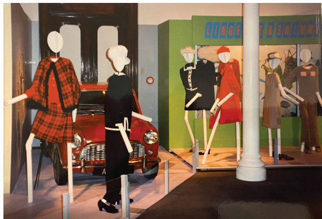
Figure 6. Hem and Hair: We even included an iconic 1960s Mini with the miniskirts.

“Hem and Hair” featured 1960s men’s and women’s dress and accessories from the Otago Museum collections in settings such as a wedding, a dance, a café and street scenes where we could use ‘shop windows’ to display some items. Partly to emphasise the slimness of fashionable bodies in that decade, and because we did not have enough forms or mannequins or budget to purchase more at the time, pipe fittings were used to create stylised anthropomorphic structures to carry the clothes.